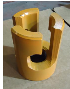
3 J HOOK