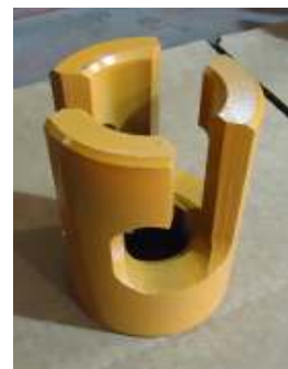
3 J HOOK